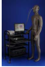
First review: a breathing "Newton".