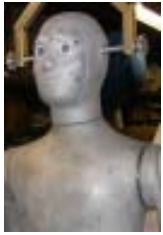
Waterproof... and sweating! Meet NEMO