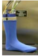
MTNW sales agents in the Pacific Rim.